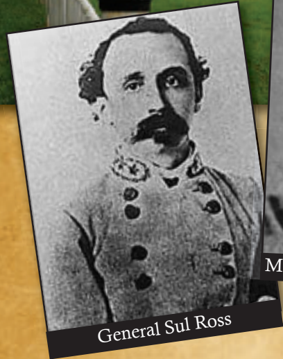
General Sul Ross