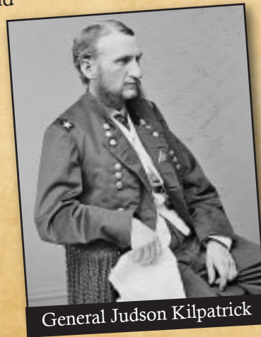
General Judson Kilpatrick

loaded by both artillery forces to inflict maximum casualties. The ensuing spectacular cavalry saber charge was over within minutes, leaving several hundred killed, wounded and captured.