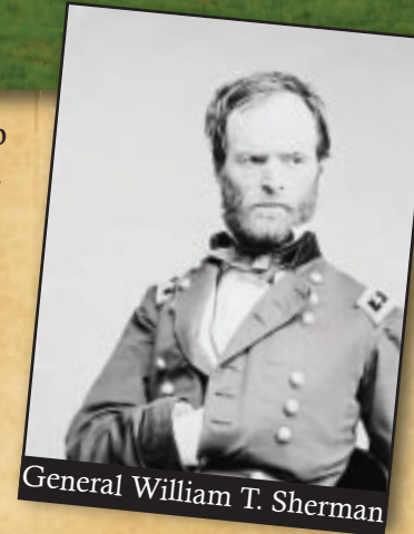
General William T. Sherman