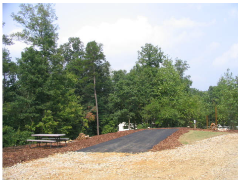
Campground with Hook-ups

Visit our web site www.GroveRiverRanch.com