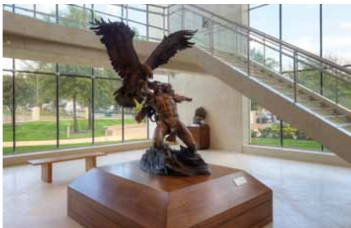
SCULPTURE COURT Two levels of large scale sculpture