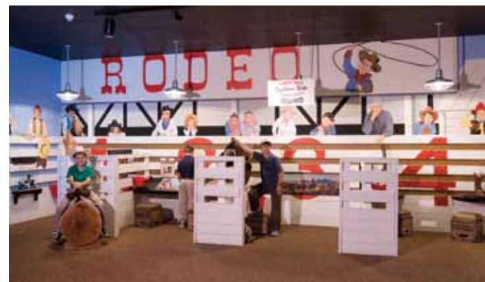
SAGEBRUSH RANCH An interactive, hands-on gallery