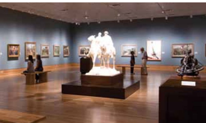
WAR IS HELL GALLERY Fifty works depicting the glory & tragedy of the Civil War