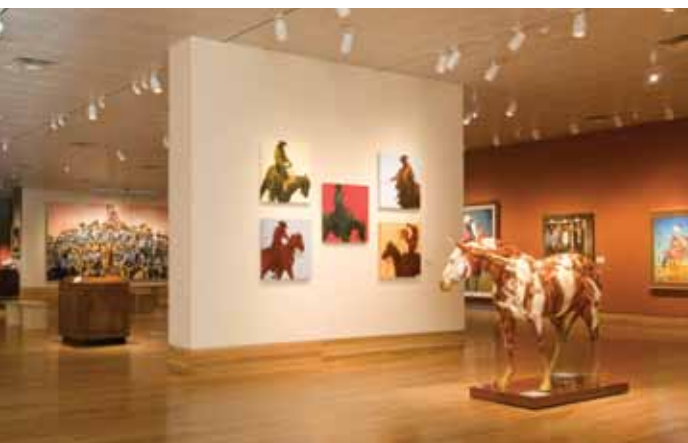
MODERN WEST GALLERY Over 100 artistic creations by today's Western artists