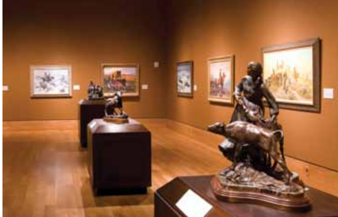
COWBOY GALLERY The American Cowboy at work, rest & play