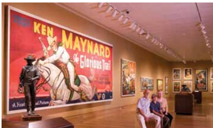
MYTHIC WEST GALLERY Pop culture views of the West