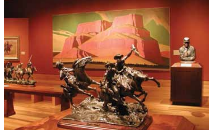
AMERICAN WEST GALLERY Over 100 works of art from 175 years of history