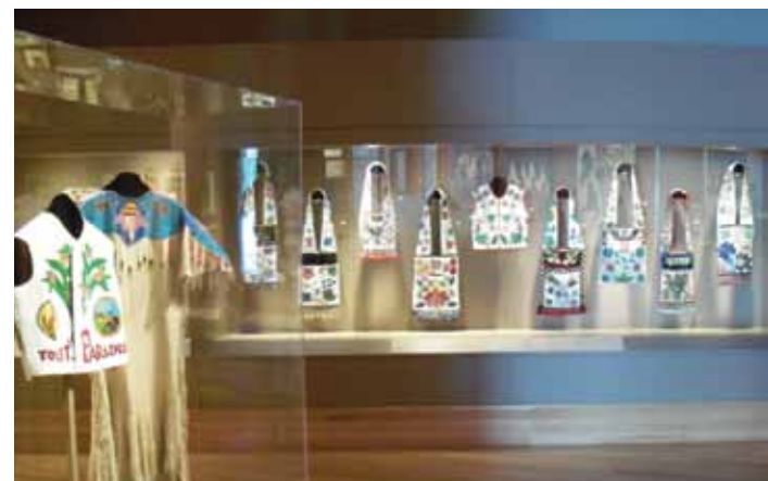
NATIVE AMERICAN ARTIFACTS Over 200 objects by Native artisans