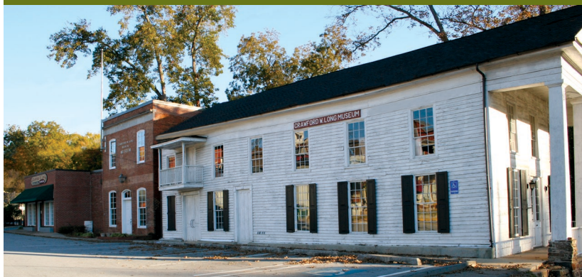
Crawford W. Long Museum in downtown Jefferson, Georgia