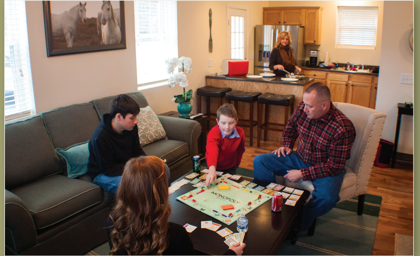
Exploring the estate, hiking, biking, horse back riding, hunting, and just spending quality time with your family are all part of a retreat to The Cottages at Mountain Cove Farms.