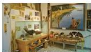
Cumberland Island National Seashore Museum

St. Marys Submarine Museum | Submarine service memorabilia, models, patrol reports, video, and a working periscope.