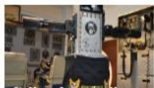
St. Marys Submarine Museum

St. Marys Waterfront Park | Ideal spot to watch boats, take a walk, have a picnic, or relax on a porch swing on the boardwalk.