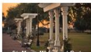
St. Marys Waterfront Park

St. Marys History Walk | A walking trail with interpretive panels outlining the milestones of St. Marys rich history.