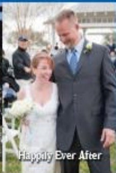
Happy Ever After