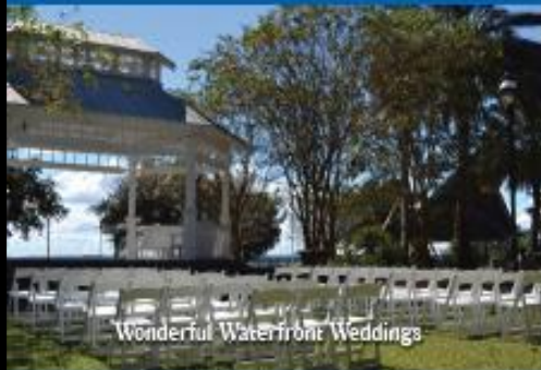
Wonderful Waterfront Weddings

200 Osborne Street 912.882.1872 spencerhouseinn.com