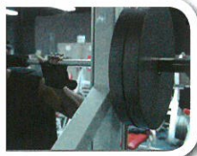
Muscle Beach Fitness