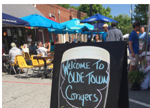
901 Railroad Street Conyers, GA 30012 • conyersga.com • 770-602-2606

Make the Welcome Center located in the historic Train Depot one of your first stops. Along with maps and brochures, our knowledgeable staff can help you plan your visit. Open Monday - Friday, 8am - 5pm.