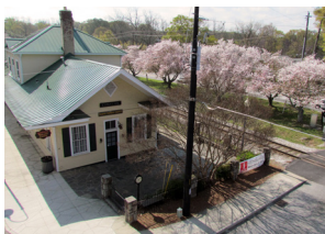
901 Railroad Street Conyers, GA 30012 • conyersga.com • 770-602-2606

A Community of Trappist Monks. Monastic Heritage Center, Historic Museum, Cafe, Lake with Picnic Area, Bonsai Garden, Abbey Gifts & Bookstore, Abbey Garden Center, Abbey Church and Retreat House with a natural green burial grounds of Honey Creek Woodlands..