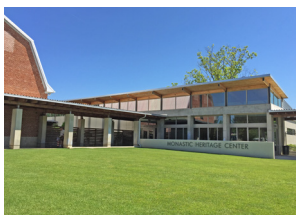
2625 Hwy 212 SW Conyers, GA 30094 • www.trappist.net • 770-483-8705