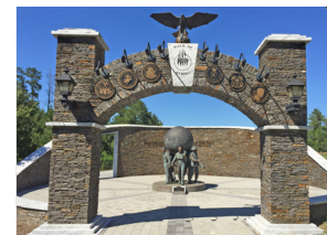
3001 Black Shoals Rd, Conyers, GA 30012 • walkofheroes.org • 404-401-7142

This bridge is the first of its kind to be built in Georgia since the 1890s. This bridge is 150 feet long and 36 feet wide. It's truss is styled with decorative lattice, and goes over Mill Rock Creek. There's a parking area, as well as a 1.75 mile scenic nature trail. Open to public.