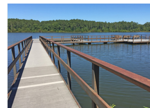
3001 Black Shoals Rd, Conyers, GA 30012 • rockdalecounty.org • 770-761-1611

In a park setting, the memorial park provides a self-paced and self-guided tour that is located on a 3 acre site adjacent to Black Shoals Park & Lake entrance. A botanical garden and public restrooms are also on site.