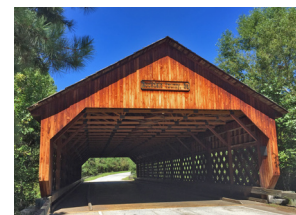
4400 Haralson Mill Rd. Conyers, GA 30013 • rockdalecounty.org • 770-278-7000