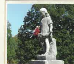
Little Girl Statue