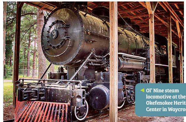
◀ Ol' Nine steam locomotive at the Okefenokee Heritage Center in Waycross

In Georgia's Plantation Trace region, Tifton offers museums, art galleries, shopping venues, historic sites, restaurants, and outdoor recreation opportunities. Don't miss The Georgia Museum of Agriculture, 95 acres with more than 30 structures from a 19th century farm that have been restored and preserved. Costumed docents present the history and activities and crafts.