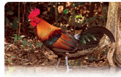
◀ The wild chickens in Fitzgerald