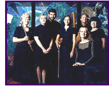
"Folded Wings" Music Ensemble

What goes on in an artist's mind while painting? Just what do the images mean? How did the artist and composer come to work together? Stay to ask the questions.