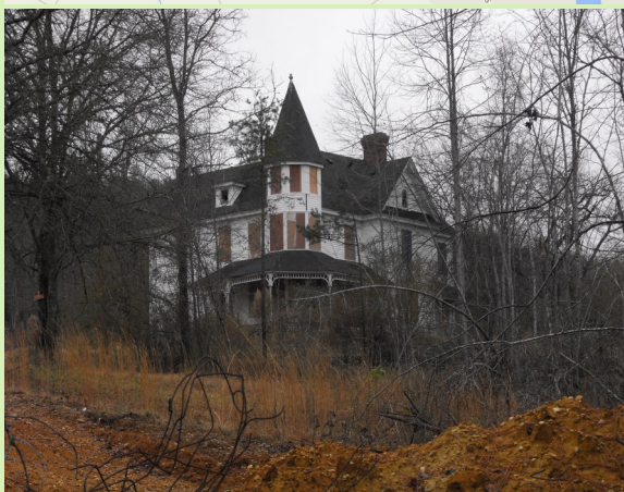
The "Priest House" in 2010