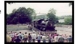
Summerville Railroad Turntable November 2007

Railroad Days. Every weekend in October-mid-November. Enjoy the October weather of Northwest Georgia and take in some spectacular events as we celebrate the arrival of fall. Bring the family out for some great fun. Greet the Tennessee Valley Railroad Passenger Trains as they arrive at the Historic Summerville Depot. Train enthusiasts don't want to miss out on these events. From our Sum Nelly Arts & Crafts Festival